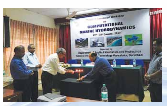
Workshop on Computational marine Hydrodynamics