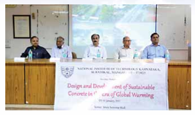
Inauguration ceremony of Workshop on Design and Development of Sustainable Concrete in the Era of Global Warming (Jan 2017)