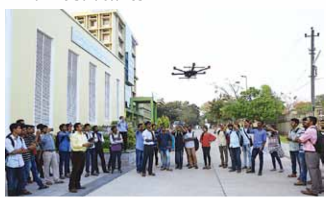
Workshop on Prakriti Infocus