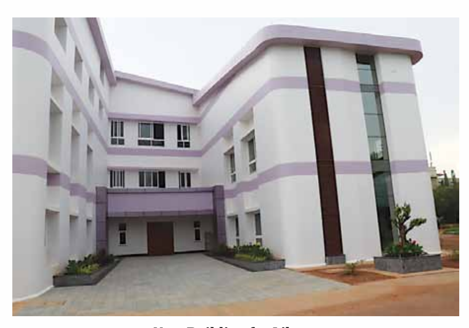
New Building for Library