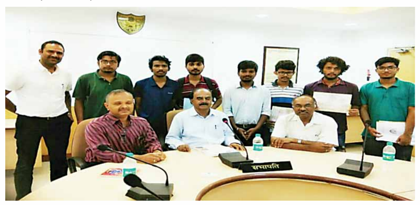
INTERNATIONAL SUMMER UNIVERSITY 2017

Eight B. Tech students from Jorhat Engineering College, Assam has successfully completed their Summer Internship under the Ishan Vikas Programme-2017 for College Students (Flagship Programme of the MHRD, Govt. of India) coordinated by IIT (Guwahati) at NITK, Surathkal. The programme has been fully funded by the Ministry of HRD.