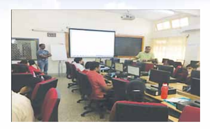
"Open-Source Network Experimentation" (ONE-17) A WINGS's 7th, 3 days' Workshop