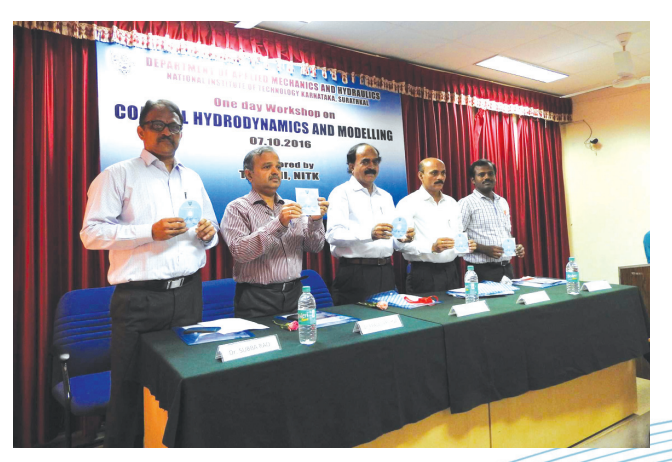
Coastal Hydronamics & Modelling