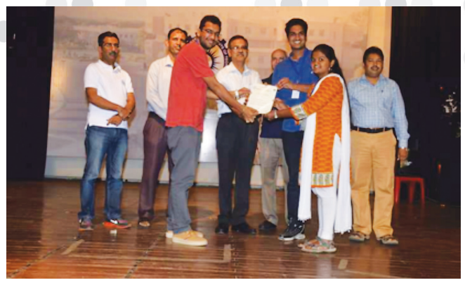
NIT Conclave 2015