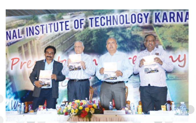
Ring Presentation Ceremony 2015