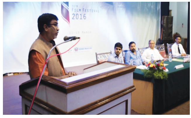
Film Festival 2016